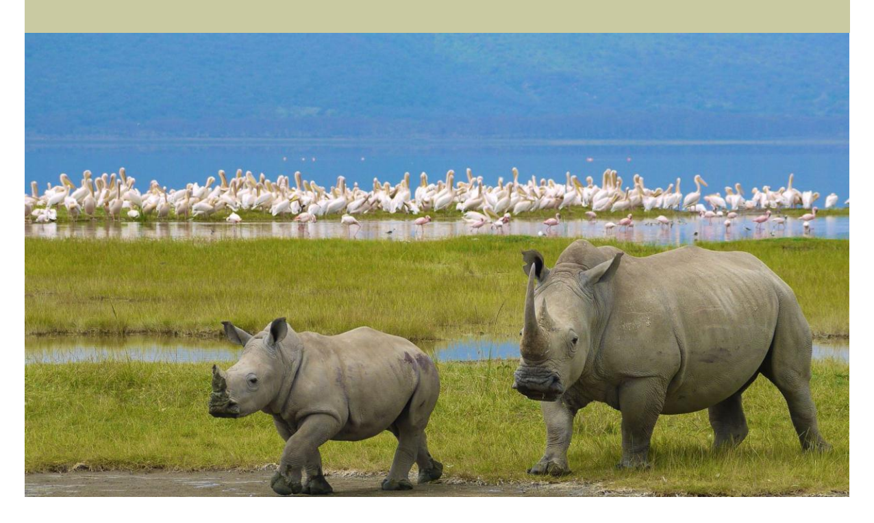
Day 4 Morning game drive then drive to Amboseli

After breakfast proceeds on a game drive in Lake Nakuru National Park, known for its prolific birdlife including flamingos. The park contains a sanctuary for the conservation of the white rhino while species like Cape buffalo and waterbuck can be seen near the shoreline. Drive to Amboseli national park arriving late evening with game viewing en-route to camp. Dinner and overnight at Amboseli Kimana Camp.