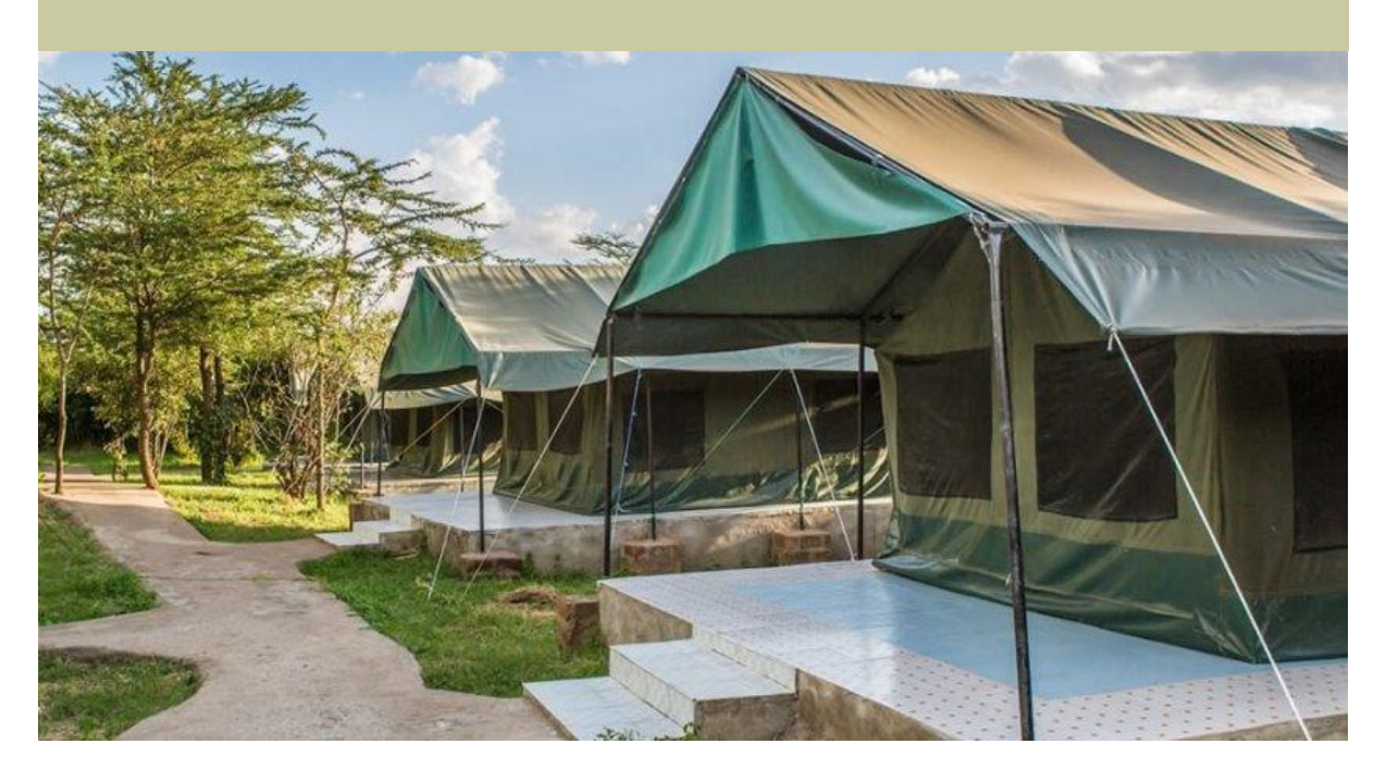
Day 2 Morning to evening game tracking

After breakfast proceed on a full day of game viewing within the reserve. The landscape here is scenic savannah grassland on rolling hills. The reserve is the best park for game in Kenya as it has an extensive road and track network which allows for close range viewing and photography. Break for your picnic lunch at the hippo pool, looking out for hippos and crocodile. Dinner and overnight at the Miti Mingi Eco Camp.